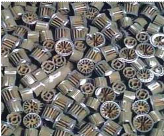
Fig. 1: MBBR media

The process of Oxidation, synthesis and endogenous respiration happens in the MBBR tank or aeration tank. Eco-friendly available in the sewage facilitates the above process; hence the complex organic compound gets converted to simpler organic substance. Bacteria or bio augments staying in MBBR Media surface and does the job utilizing the supplied oxygen through Air blowers.