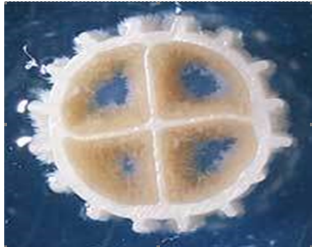
Fig. 2: Bacterial attachment

Chlorine disinfection system installed to oxidize the pathogenic bacteria from the treated sewage water and then