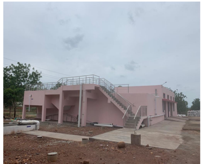
Fig. 3: STP 1 MLD front view

allowed to pass through the filtration units like PSF and ACF.