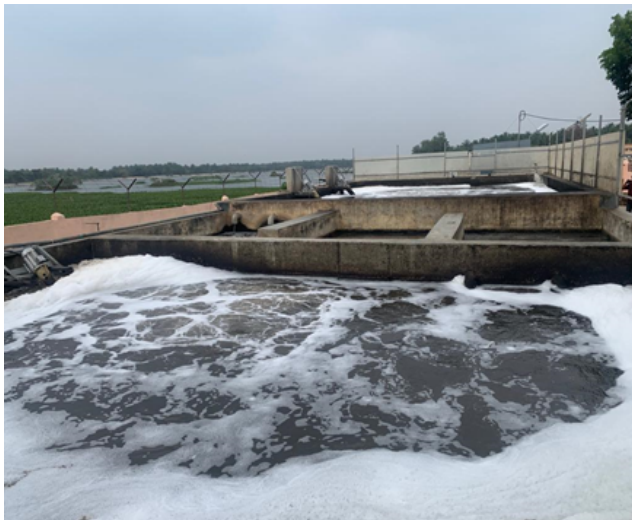
Fig. 4: MBBR aeration zone