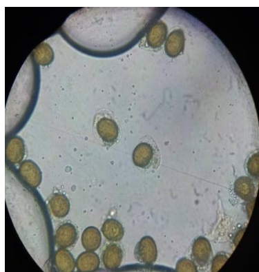
Fig. 1: Eggs of D. latum

Routine examination of stool sample showed undigested food particles and cream coloured tape-like structures, indicating some tapeworm infestation. Wet mount preparation showed the presence of large number of oval shaped, bile stained eggs, measuring approximately 70 \mu\text{m} \times 45 \mu\text{m} with an operculum at one end. [Fig. 1]. Typical proglottids, broader than the length, were identified. However there was no identifiable scolex. [Fig. 2]. On the basis of the morphology of the eggs with operculum and the presence of broader than long segments, the parasite was identified as Diphyllbothrium latum . Blood picture revealed hemoglobin of 9.7 g/dL and a total count of 8500/mm 3 . Differential counts were within normal limit except for eosinophil slightly raised (9%). The peripheral blood smear showed hypersegmented neutrophils suggesting megaloblastic anaemia. [Fig. 3]. She was treated with a single dose of Niclosamide 2g and follow-up stool test for ova and parasites done two weeks later were negative. Her hemoglobin level was also increased to 12 g/dL done three months later.