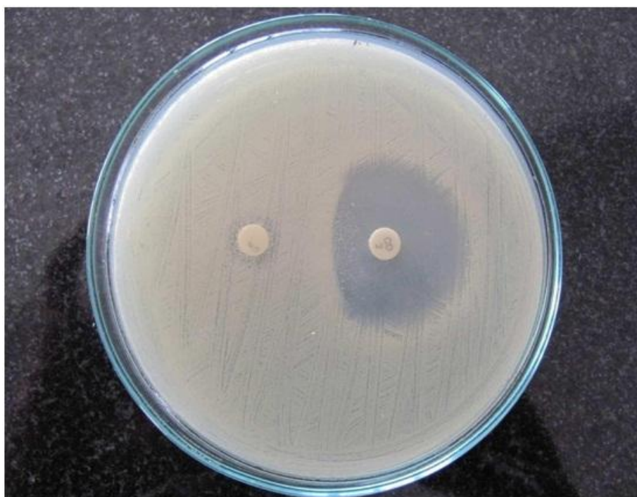
Fig. 3. Shows inducible Clindamycin resistance. Note flattening or blunting of zone of inhibition around Clindamycin disc