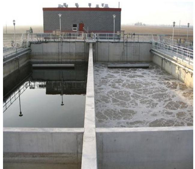
Fig. 1: SBR zone