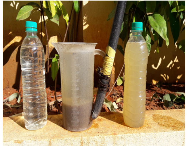
Fig. 4: STP treated water

From the filter feed tank, the clear water is pumped to the pressure sand filter. The filtration takes place in the downward mode. The filter is filled with a layer of graded sand media supported by a layer of graded gravel. The