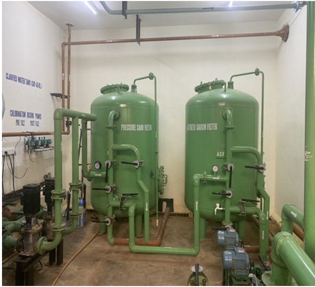
Fig. 2: PSF & ACF