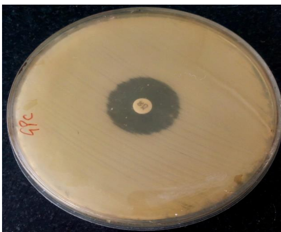
Fig. 1: Cefoxitin Sensitive Isolate

Two standard strains, one Methicillin sensitive S. aureus (MSSA) ATCC (29213) and one MRSA ATCC(43300) were included in each batch of testing by different method.