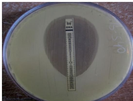
Fig. 3: E-test MIC Oxacillin Sensitive isolate