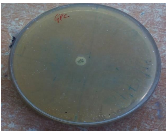
Fig. 2: Cefoxitin Resistant Isolate