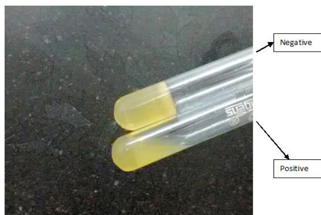
Fig. 2: Gelatinase Production of Pseudomonas aeruginosa