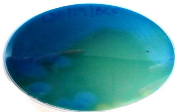
Fig. 1: Typical B. cereus colony

Food wise analysis for the presence of B. cereus is shown in Table 2. More than half of the analyzed samples were contaminated with B. cereus . In terms of percentage of samples contaminated, soan papdi ranked the top while ghugni samples were least contaminated. Of all the samples, laddu possessed both highest (3x10 6 cfu g -1 ) and lowest (1x10 3 cfu g -1 ) B. cereus count. Average B. cereus count of the three types of foods considering the positive samples only revealed that soan papdi samples contained highest mean B. cereus count of 6x10 5 cfu g -1 . Similarly lowest mean B. cereus count of 3x10 5 cfu g -1 was reported from ghugni samples.