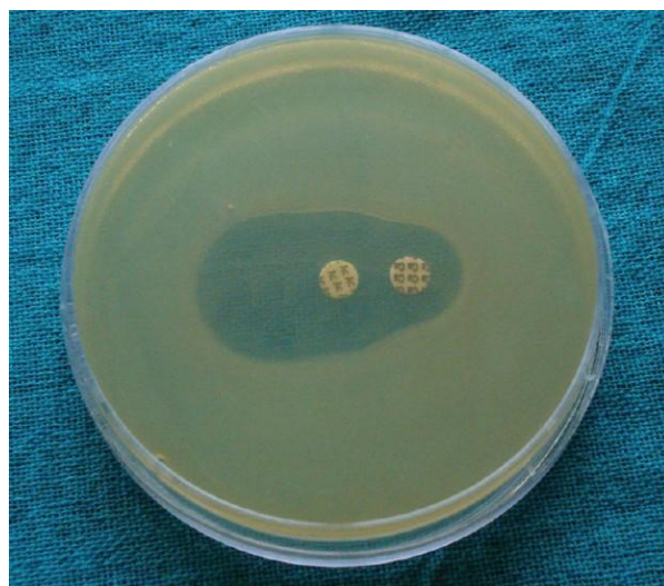
Fig. 2: Double disk diffusion synergy test for detection of ESBL

In 81 culture-positive infections, 33(41%) drug resistant bacterial infections were identified: 27 (81%) Extended spectrum Beta Lactamases (ESBL), 4(10%) Methicillin resistant Staphylococcus aureus (MRSA), 1(2.3%) Vancomycin resistant Enterococci (VRE) and 1(2.3%) Metallo Beta lactamases (MBL). Of the culture-positive infections, these drug resistant bacterial infections occurred in 11 of 21 (52%) of the UTIs, 8 of 22 (36%) of the SBP, 3 of 15 (20%) of the spontaneous bacteraemia cases, 7 of 13 (54%) of the pneumonia and 4 of 10 (40%) of the skin and soft tissue infection cases.