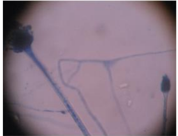
Fig. 2: A.Sydowii under lactophenol cotton blue mount

Among bacteria, Staphylococcus aureus and Pseudomonas spp. were the predominant isolates. These organisms were isolated from normal external auditory canal also. Trauma, exposure to water, persistent ear discharge and seborrhea were considered to be the predisposing factors for infection with these bacteria. (57) S. aureus and Pseudomonas spp. are the major isolates from cases of external otitis in Indian studies. (24,33,58) Mixed bacterial and fungal infections were also reported in Indian studies. (21,24,33,58) Bacterial infection of auditory canal may be one of the predisposing factors for development of otomycosis. Further, use of antibiotic steroid drops for treating external otitis may predispose for fungal growth. (4) No pathogenic bacteria or fungus were isolated from control group. All major pathogenic bacteria were sensitive to routinely used antibiotics like, aminoglycosides and fluoroquinolones.