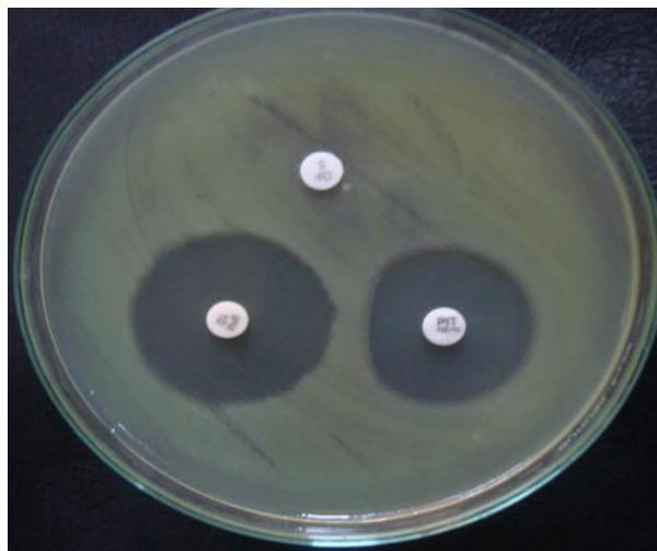
Fig. 2: Antibiotic sensitivity result of a Staphylococcus aureus isolate grown in Muller Hinton Agar