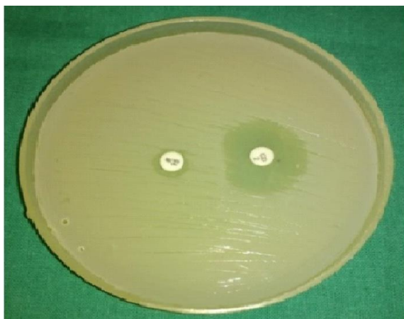
Fig. 1: MRSA isolate showing inducible clindamycin resistance

Methicillin resistance was identified using cefoxitin (30µg) disk. Antibiotic susceptibility test for MRSA was done using Kirby-Bauer disk diffusion method for conventional antibiotics such as Cefipime (30µg), Ciprofloxacin (5µg), Ofloxacin (5µg), Pefloxacin (5µg), Gentamicin (10µg), Amikacin (30µg), Tetracycline (30µg), Clindamycin (2µg), Erythromycin (15µg), Cotrimoxazole (23.75/1.25µg), Linezolid (15µg), Teicoplanin (30µg) and Vancomycin (30µg). The antibiotic panel was selected based on the CLSI guidelines. Inducible clindamycin resistance was detected using clindamycin (2 µg) and erythromycin (15µg) disks by disk approximation test (D-test). (8) (Fig. 1).