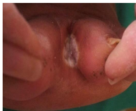
Fig. 2: 5 th Toe web space