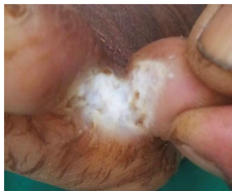
Fig. 1: 1 st Toe web space

that 60% of the patients presented with duration of infection for more than 60 days followed by 28% with duration of 41-50 days and 12% with duration of 11-21 days. Skin scrapings were subjected simultaneously to direct microscopic examination using 10% or 20% potassium hydroxide and cultured on to fungal culture media for isolation of fungus. In total of 75 samples 34 samples yielded growth in which 31 were KOH positive and 3 were KOH negative (Table 1) and remaining 41 samples were both KOH & culture negative (Table 1). Out of 34 cultures positive samples, yeasts growth was observed in 21 samples, in which Candida albicans were 15(44.1%) isolates and Non-candida albicans were 6(17.6%) isolates remaining samples yielded growth of moulds in which Dermatophytes (Trichophyton species-3, Epidermophyton-1) were 4(11.7%) isolates and Fusarium yielded growth in 9(26.4%) samples (Table 2).