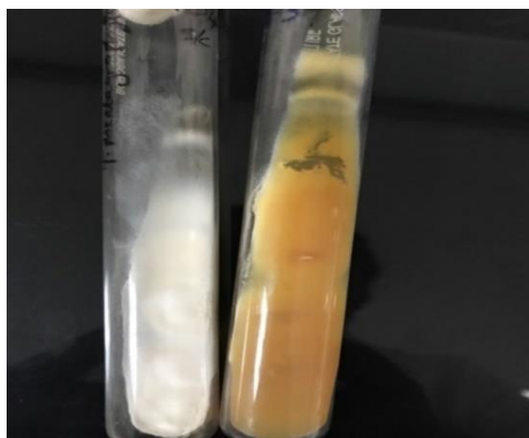
Fig. 5: Positive culture in SDA (moulds)