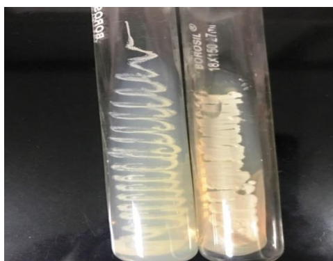
Fig. 6: Positive culture in SDA(yeast)